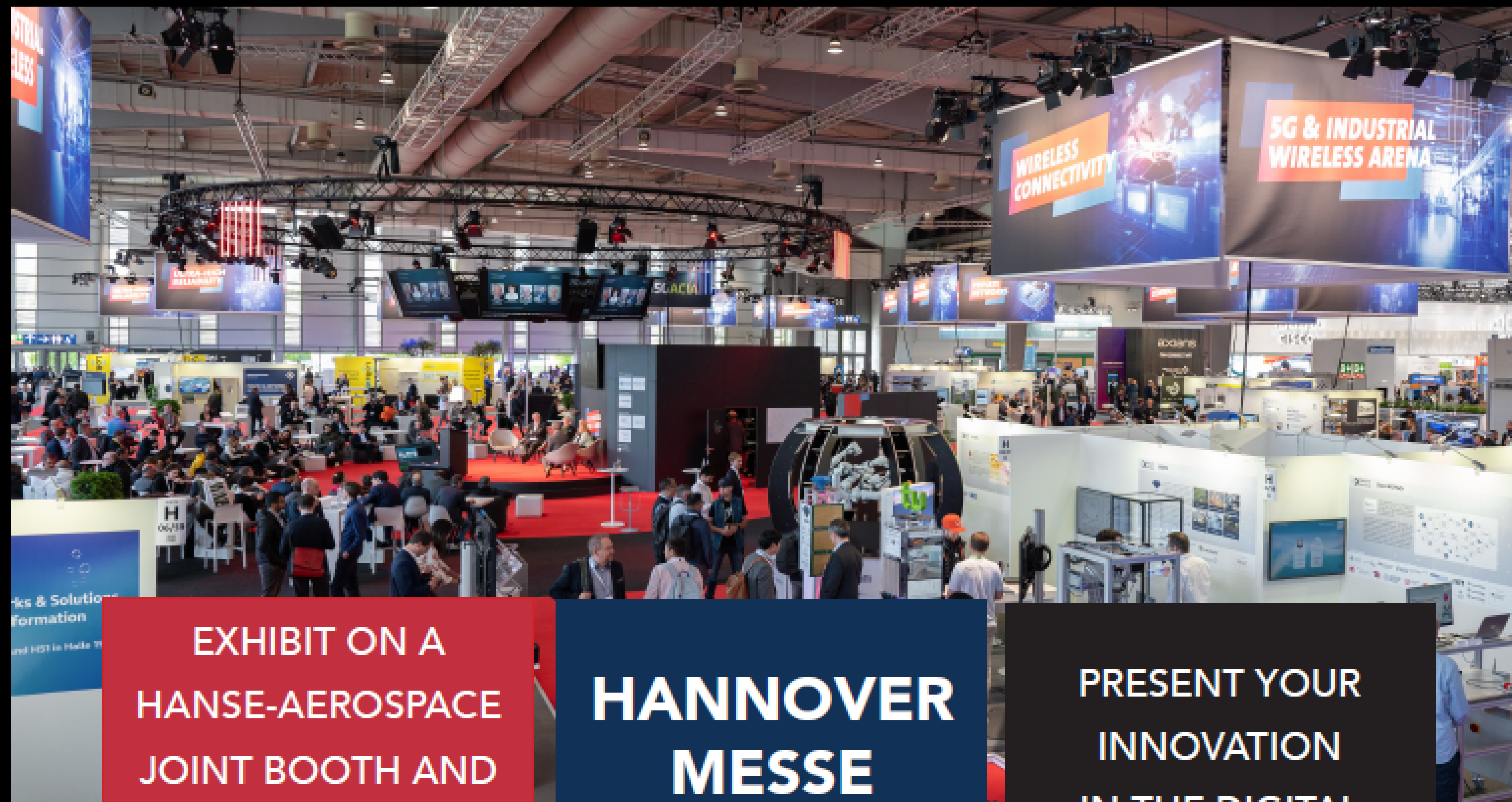
EXHIBIT ON A HANSE-AEROSPACE JOINT BOOTH AND LET US PUT YOU IN THE SPOTLIGHT